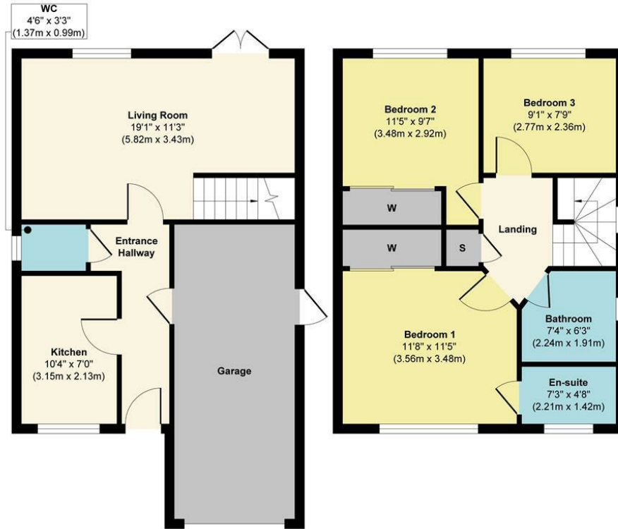
Ground Floor Approximate Floor Area 361 sq. ft (33.53 sq. m)